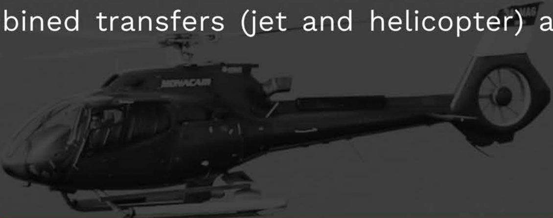
Rate schedule as of January 1th, 2025* :

To extend its range of services as Official Carrier of the Historic French Grand Prix 2025, IXAIR has selected Monacair, a leader in high-end helicopter services, to meet the demand for helicopter charters for the event. Monacair will operate flights from Monaco, Nice, Cannes and other locations to ensure fast, seamless access to the Le Castellet circuit. The strategic partnership between IXAIR and Monacair will also enable customers to benefit from combined transfers (jet and helicopter) and ensure a privileged welcome at the circuit during the event.